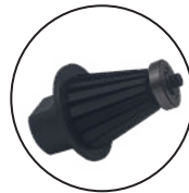
16 Flute Cutter Face

U.S.SAWS bevelling attachments allow for the operator to bevel QUICKLY, SAFELY and EFFICIENTLY.