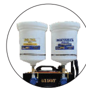
6.5 GALLON TANKS