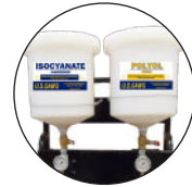
6.5 GALLON TANKS