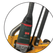
EQUIPPED WITH METABO W26-230