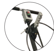
ADJUSTABLE DEPTH UP TO 2"