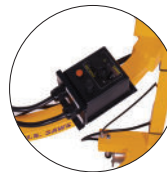
VARIABLE SPEED CONTROL BOX