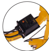
VARIABLE SPEED CONTROL BOX