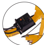
VARIABLE SPEED CONTROL BOX (OPTIONAL)