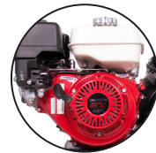
Honda Gas Engine