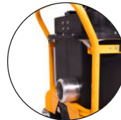
220 CFM DUST PORT