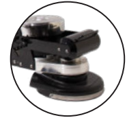
Polyurethane Dust Shroud