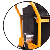
220 CFM Dust Port