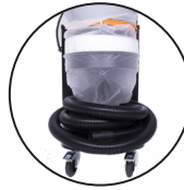
Longo Bag Easily Attached