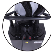
2 HEPA Filters

U.S.SAWS DuraVac 221B is a lightweight and extremely durable industrial dust collection system. This industrial vacuum is equipped with tested and certified HEPA filters that trap the most dangerous to breath dust particles and prevents them from being released in the air. The Dura Vac not only exhausts perfectly clean air, it is far more efficient for the fast recovery of bulk dry dust, debris and other building materials found on every construction, abatement and restoration job site. The DuraVac 221B is OSHA certified dust collection system.