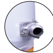
2" Hose Inlet - 215 CFM