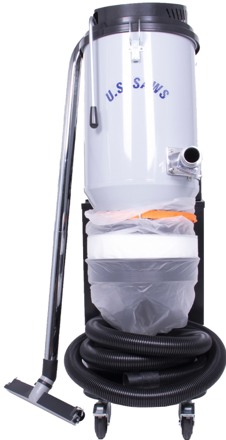
The Dura Vac Dust Collection System comes standard with 2 HEPA filter, a Longo starter pack, wand and vacuum head.

U.S.SAWS DuraVac 221B is a lightweight and extremely durable industrial dust collection system. This industrial vacuum is equipped with tested and certified HEPA filters that trap the most dangerous to breath dust particles and prevents them from being released in the air. The Dura Vac not only exhausts perfectly clean air, it is far more efficient for the fast recovery of bulk dry dust, debris and other building materials found on every construction, abatement and restoration job site. The DuraVac 221B is OSHA certified dust collection system.