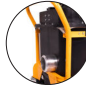
450 CFM Dust Port

The large 12 pleat poly felt filter allows continued airflow even when the 12.5 gallon dust bin is near capacity. Complies with OSHA Table 1 regulations.