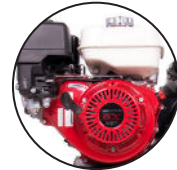
Honda Gas Engine