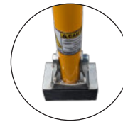
STAINLESS STEEL BASE PLATE