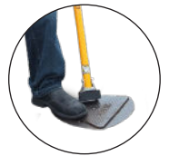
EASY TO REMOVE