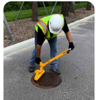
4. REPLACE & RELEASE