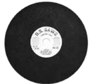
VALUE WHEEL (MA)