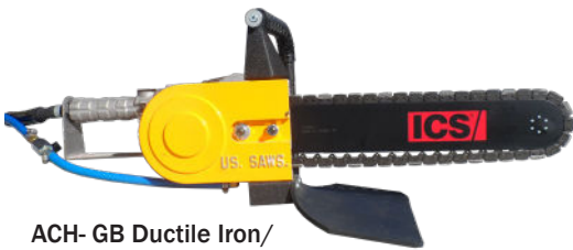
ACH- GB Ductile Iron/ PowerGrit

The U.S.SAWS ACH-GB series chains saws are designed for demanding jobs that require cutting of ductile iron and other types of pipe. You can also pair it with our standard concrete chain to create a concrete cutting saw. This type of concrete cutting is ideal for applications requiring square corners without overlapping cuts. It has the capabilities of a plunge cut up to 16" deep. It can be powered with commonly used power sources. The ACH-GB line of chain saws has the power you need to get the job done quickly and safely.