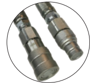
FLUSH FACE QUICK DISCONNECTS