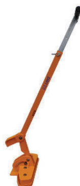
4 MAGNET UTILITY ROBOTRON PART NO. US30188UTILITY