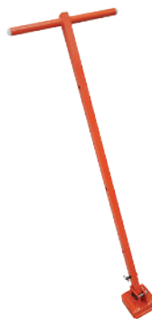
TRENCH PLATE MOVER PART NO. US30297 (1 MAGNET) PART NO. US30293 (2 MAGNET)