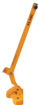
3 OR 4 MAGNET ROBOTRON PART NO. US30178RT (3 MAGNET) PART NO. US30188RT (4 MAGNET)