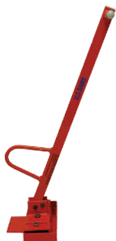
3 MAGNET BREAK N'TAKE PART NO. US30178